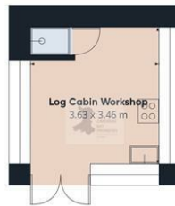
Floor 0 Building 3